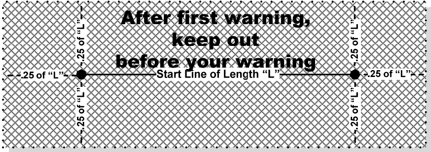
The Starting Area

After the first warning signal for a race and prior to her warning signal, a sailboat shall keep clear of the starting area that extends one-quarter of the length of the starting line ahead of and behind the starting line. It shall also extend one-quarter of the length of the starting line past either end of the starting line