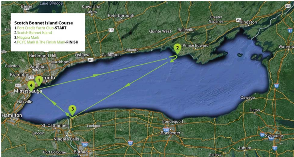
Diagram 2 Scotch Bonnet Island Course