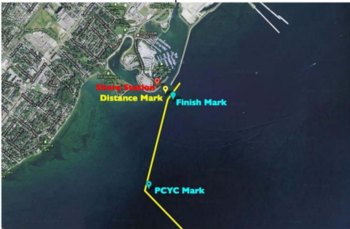
Diagram 2 The Finish

The Starting Area After the first warning signal for a race and prior to her warning signal, a sailboat shall keep clear of the starting area that extends one-quarter of the length of the starting line ahead of and behind the starting line. It shall also extend one-quarter of the length of the starting line past either end of the starting line