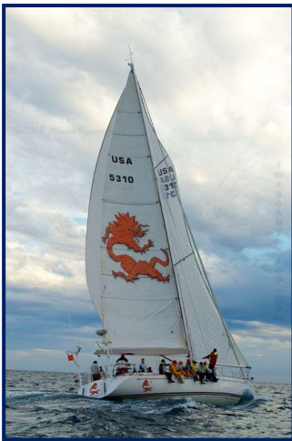
"Dragon Fly Plus" 2014 PHRF and Committee Trophy winner.