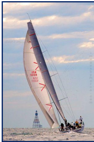
"Privateer" 2014 first boat to finish.